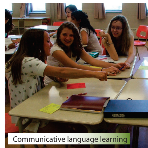
Communicative language learning

For more information or to register, please contact: